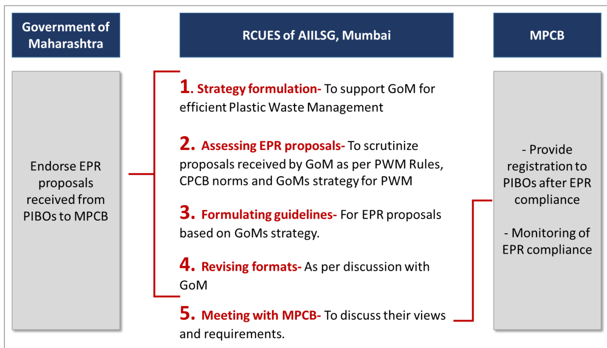
Figure 4-1 Support to GoM for EPR under PWM

The following chapter details out the literature on EPR reviewed, cases of EPR implementation studied, comments on the EPR proposals and revised format for formation of action plan.